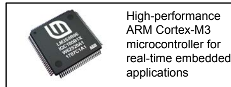
High-performance ARM Cortex-M3 microcontroller for real-time embedded applications