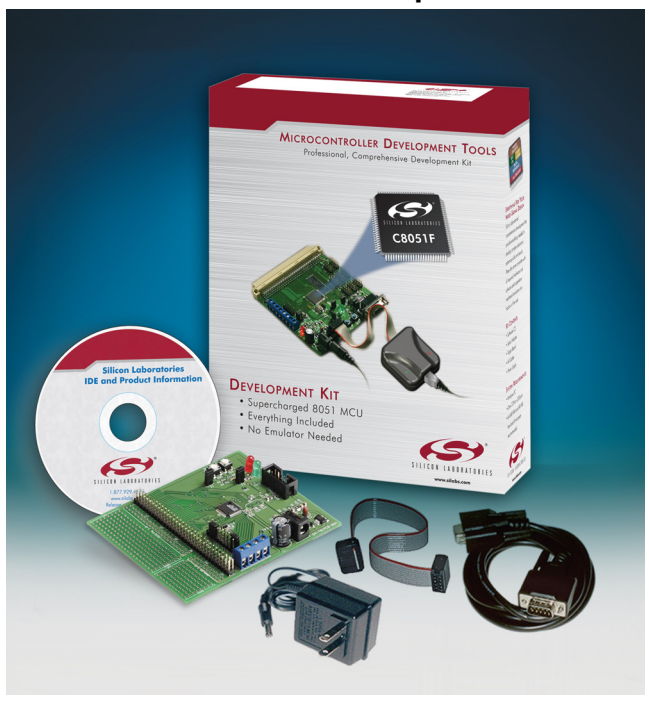
Small Form Factor